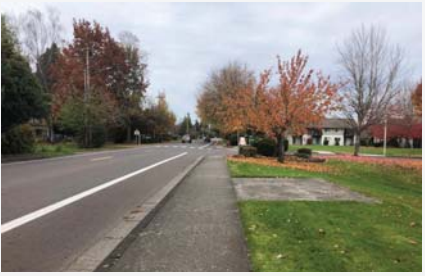
BICYCLE LANES AT PARKMEADOW DR INTERSECTION